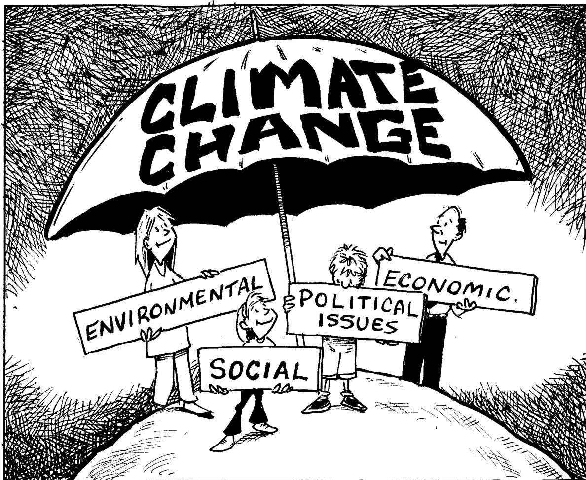
Illustrations: Tom Goldsmith